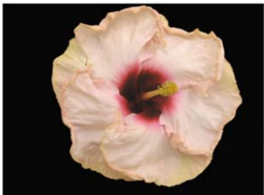
IN LOVE AGAIN