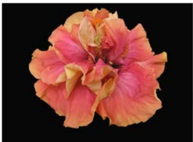
PRIDE OF ACADIANA