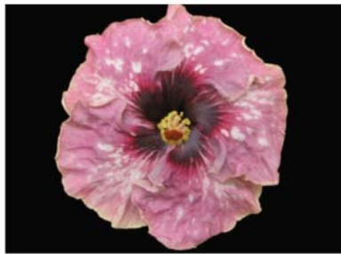
ME OH MY OH