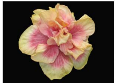
OOH LA LA