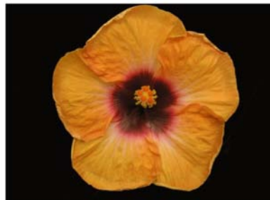
LIGHT MY FIRE