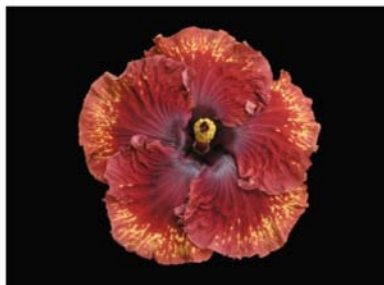
RED BEANS & RICE